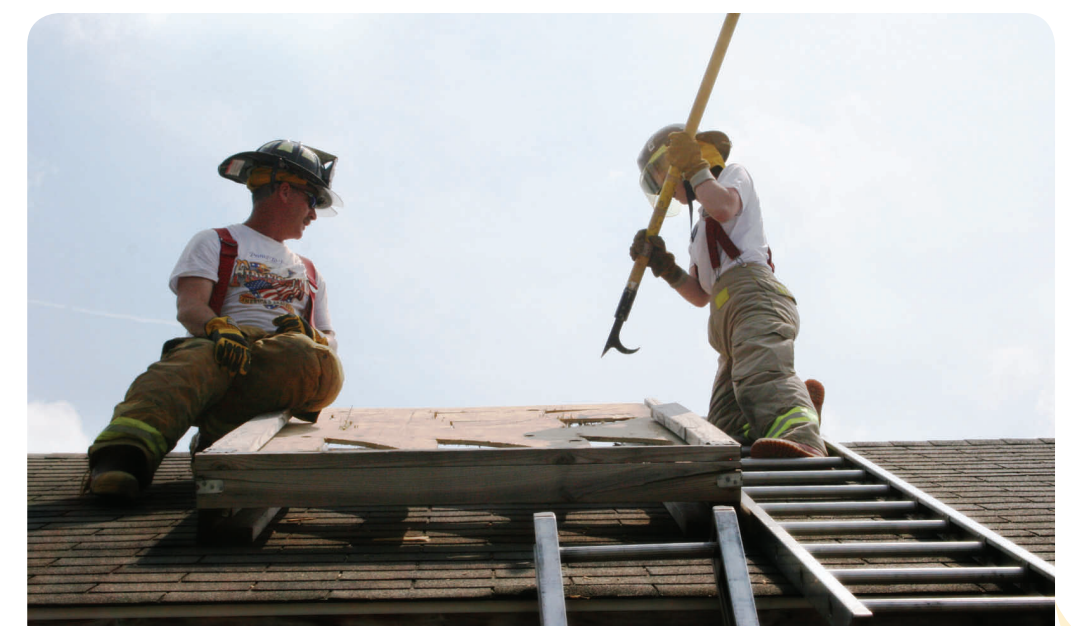
Campers practice unfamiliar tasks and build confidence in their ability to meet new challenges.